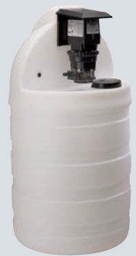
30-GALLON (113.6 LITERS)

TANK SYSTEM INCLUDES A CLASSIC SERIES SINGLE HEAD ADJUSTABLE OR FIXED OUTPUT PUMP