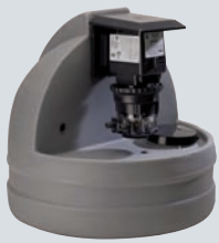
7.5-GALLON (28.4 LITERS)